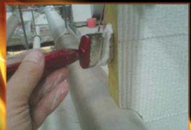
Buttering Up The Edges of The Intubatt