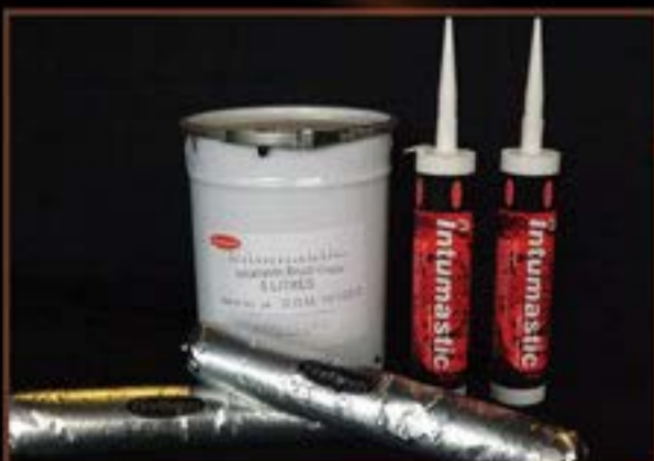
Available in Tube, Sausage or Tub