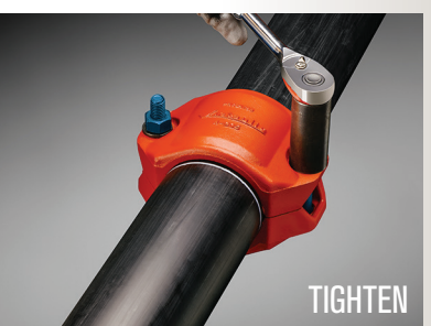
Note: Reference the IT-905 for complete installation requirements.