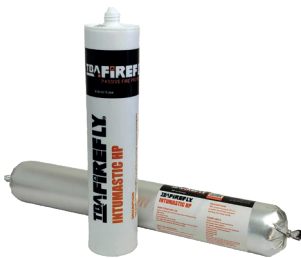
Intumastic HP Cartridge and Sausage