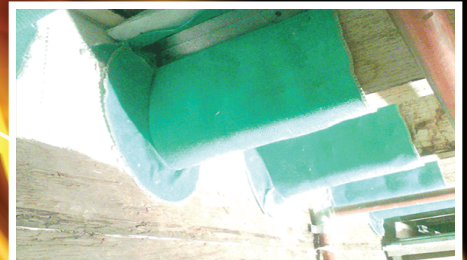
Used for a 3 Sided Application